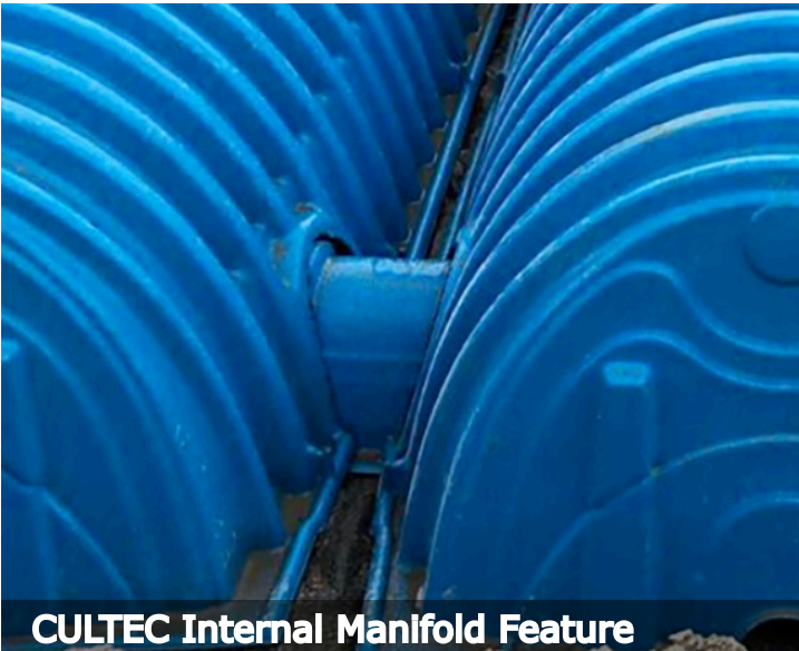
CULTEC Internal Manifold Feature

The team faced various challenges during the design and installation of the stormwater management system. Originally nicknamed the "Great Swamp" by early settlers in the 1700s, the site required prep work including site stabilization and purging as well as consideration of the site's high groundwater.