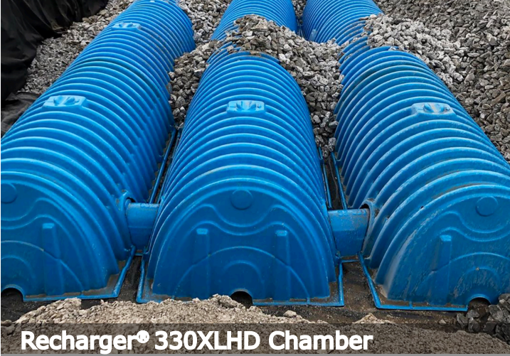
Recharger® 330XLHD Chamber

CULTEC's Recharger 330XLHD chambers are designed for traffic applications and capable of withstanding the weight of the tractor trailers that will visit the storage facility daily. This particular project included a total of 931 chambers that provide the site with 79,419 cu. ft. of storage when surrounded by stone. A single chamber measures 30.5" high, 52" wide and 8.5' long and holds 475 gallons.