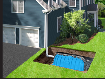
Dry Well Applications