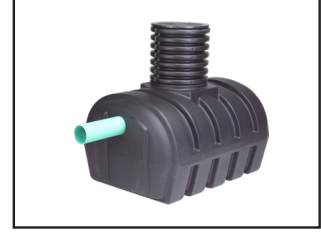
StormFilter T-80 Water Quality Unit