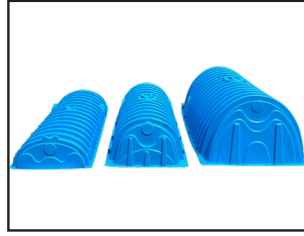
Residential Stormwater Chambers