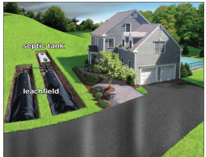
Septic tank and leachfield using CULTEC chambers.