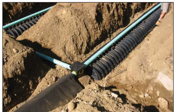
Septic leachfield using CULTEC chambers in pipe distribution system.