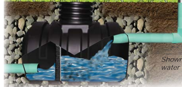
Shown: StormFilter T-80 filtering water collected by downspout.