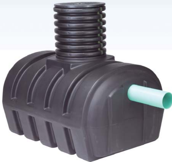
Shown with optional accessories. Riser and pipe sold separately.

CULTEC StormFilter® T-80 is a cost-effective filtration unit used to remove leaves and debris from rainwater collected by catchbasins or gutters. StormFilter T-80 prevents leaves and debris from clogging outflow systems and piping. Rainwater is piped into the endwall of the StormFilter T-80 and passed thru a removable filter. Pollutants are collected within the tank and may be removed by a wet/dry vac. The filter bag may be cleaned or replaced. This compact unit is easy to install and simple for the homeowner or maintenance personnel to maintain. It is perfect for treating roof and driveway runoff for light commercial or residential applications.