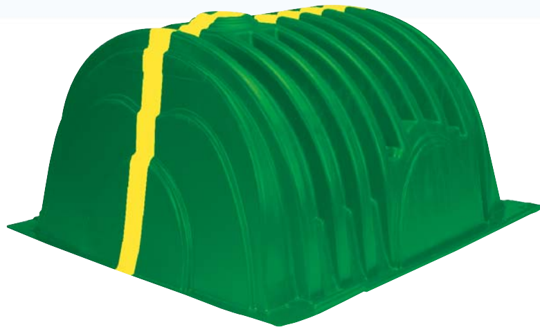
Recharger® V8R LS

CULTEC's Landscaper Series™ chambers are used in residential applications to control rainwater collected from gutters and/or catch basins. The chambers collect and store the stormwater underground until the soil is able to accept it back into the ground. Puddles and saturated soil are eliminated as water is diverted into the chamber and recharged into the ground. CULTEC chambers are lightweight and easily transported by hand making them ideal to install in tight areas or where minimal site disturbance is desired.