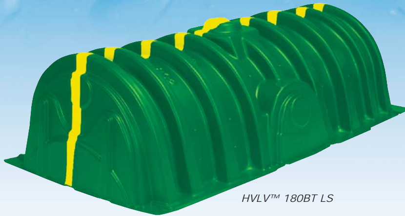
HVLV™ 180BT LS