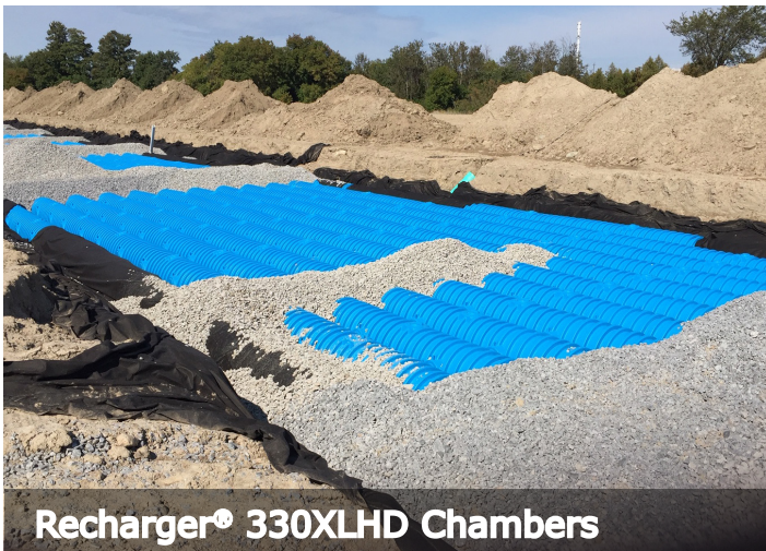
Recharger® 330XLHD Chambers

The pre-construction lot consisted of an agricultural field and a tributary of a local river through the eastern portion of the site, which is where the majority of the site naturally drains into. Since it has never been excavated, soil remediation was not required but special attention would need to be paid towards the natural flow of stormwater runoff – especially since this would be such a large development. When faced with the need for a stormwater system of this magnitude, the civil consultant looked towards CULTEC to recommend a solution.